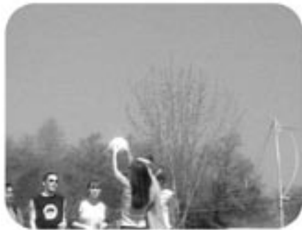
VO: "We lost, though, 'cause you weren't there."