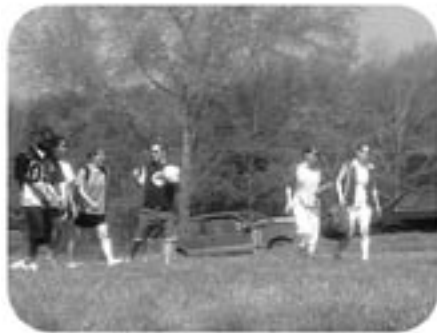
Music fades up and under sounds of kids talking