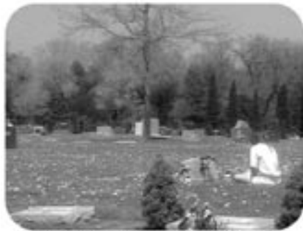
VO: "They're planning a speech in your honor. They asked me to help, but I just couldn't do it."