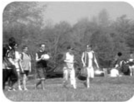
VO: "Last weekend was great!"