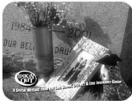
Announcer VO: "Lookin' Out . . . A Special Message from the Erie School District and Erie Insurance Group"