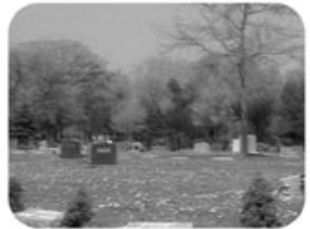
Pan from sky back down to a cemetery where you see girl sitting next to tombstone.