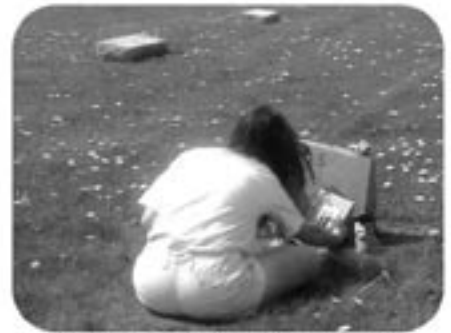
VO: "Everyone always thinks, 'It won't happen to me.'"