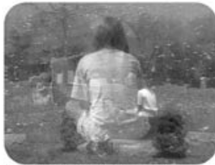
VO: "I can't even go down that road anymore. We were stupid for trying to pass that car."