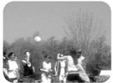
VO: "We played volleyball like we usually do."