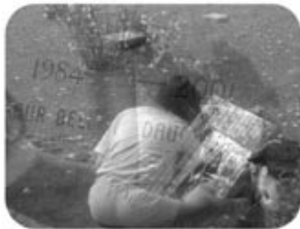
VO: "I feel like it was all my fault. I'm sorry . . ." (voice trails off)